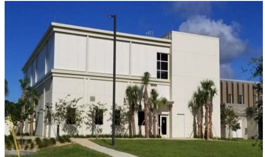
Eglin AFB F35A Armament Research Facility Addition – Small Business Set-aside