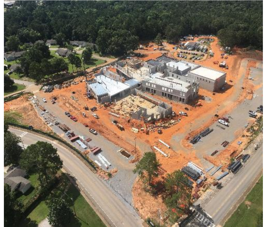
Elementary School, Ft. Rucker, Alabama