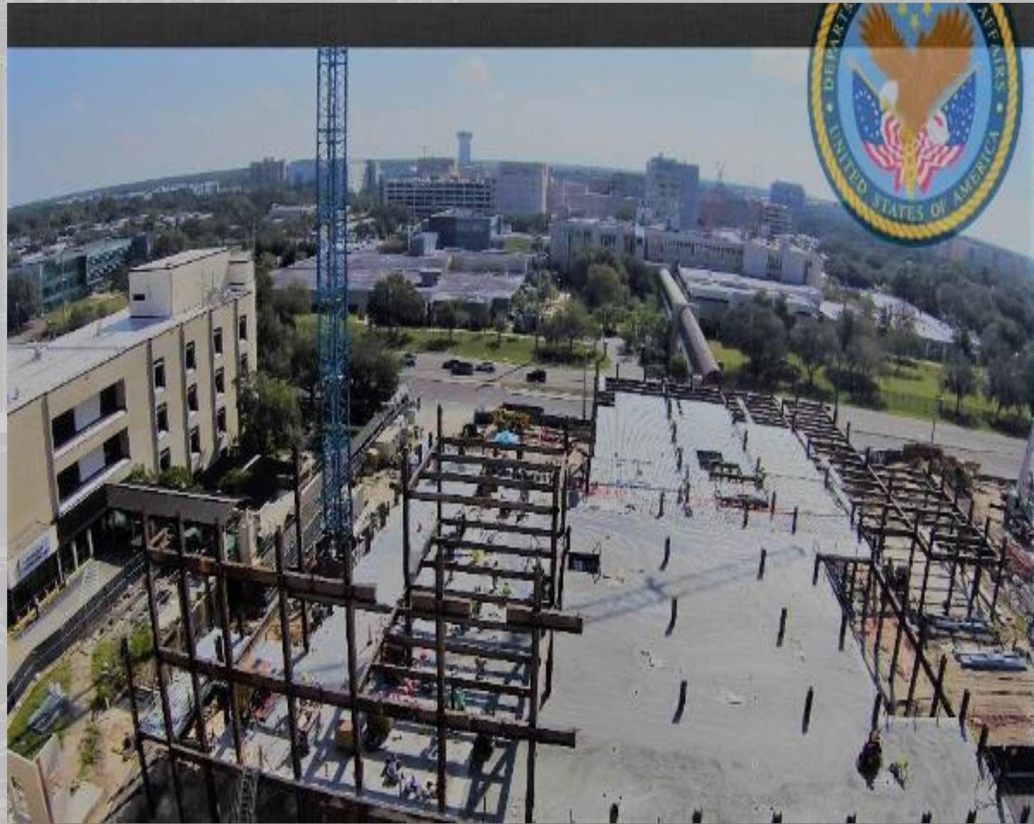
James A. Haley VA Medical Center, Tampa, Florida